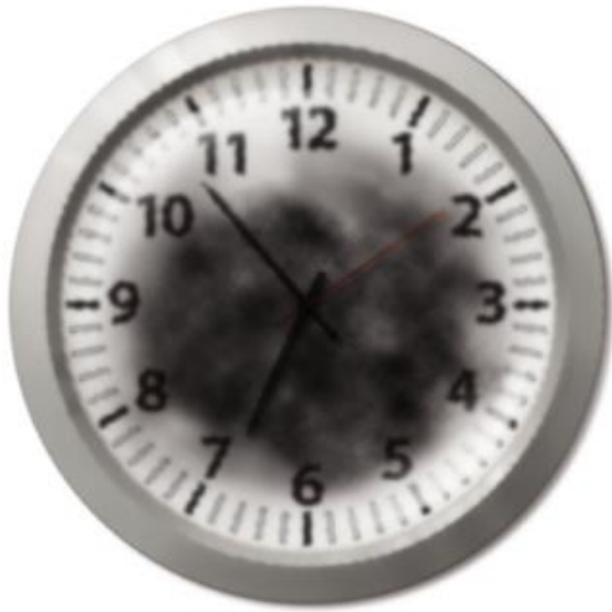
With AMD, dark areas may appear in your central vision.

Many people with AMD have drusen. These alone do not cause vision loss. But when drusen grow in size or number, you are at risk for getting early or intermediate AMD. There are not always symptoms with these stages of AMD, though people with intermediate AMD might start to notice a blurred spot in their central vision.